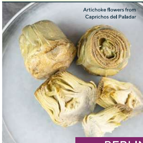
Artichoke flowers from Caprichos del Paladar